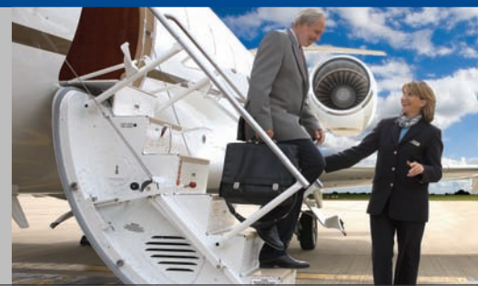
Dedicated cabin staff ensure you arrive relaxed.

Whether you're conducting business in the air, preparing yourself for important business when you land or simply travelling for pleasure, the Challenger meets the challenge.